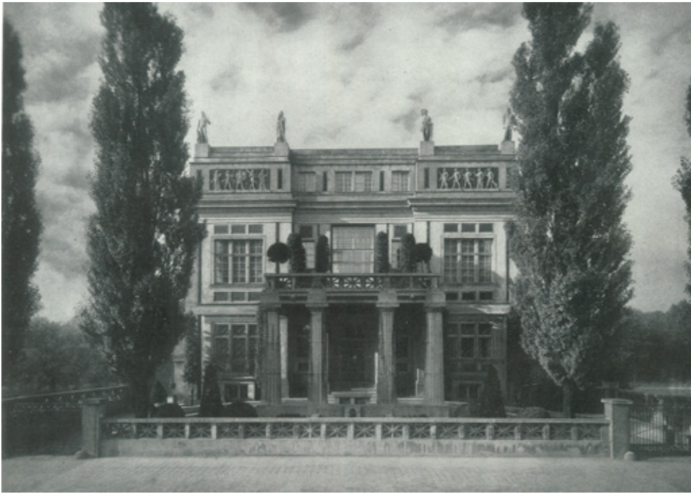
Fig. 2. Main facade of Villa Stuck, photography, source: Ostini, Fritz. Villa Franz von Stuck , München, Darmstadt: Verlagsanstalt Alexander Koch, 1909, 3.