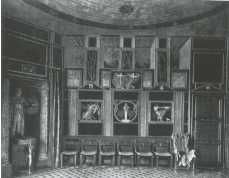
Fig. 4. The wall of the Villa Stuck Music Salon with the images of dancers and Pan, photography, source: Mendgen, Eva. Franz von Stuck 1863–1928 – Ein Fürst im Reiche der Kunst , Köln: Benedikt Taschen Verlag, 1994, 35.