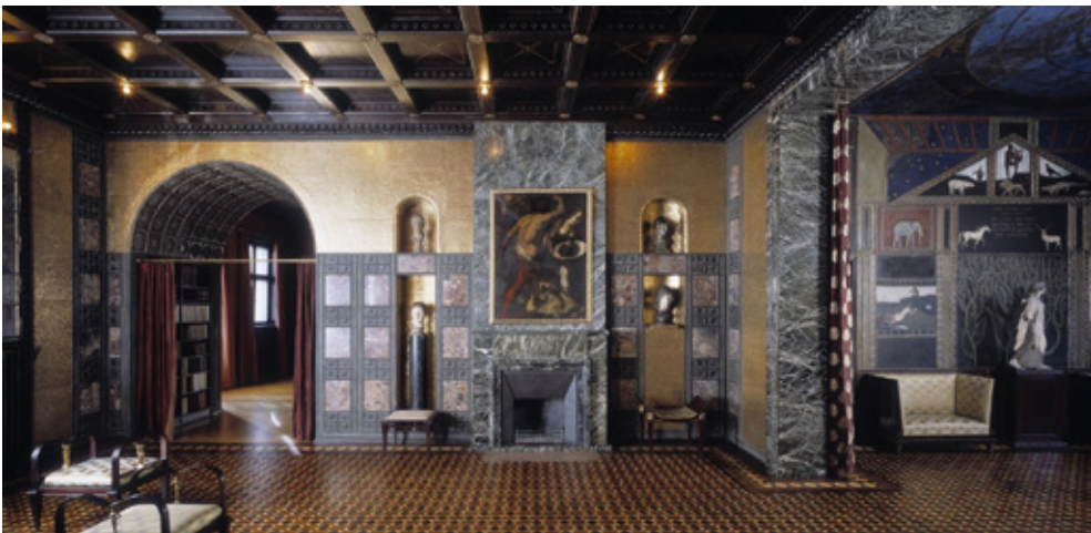
Fig. 3. Interior of Villa Stuck with a view of the Reception Room and the Music Salon, photography, August Lorenz, 1898, Museum Villa Stuck, source: Brandlhuber, Margot Th. Michael Buhrs (ed.). Im Tempel des ich – das künstlerhaus als Gesamtunstwerk Europa und Amerika 1800–1948 , Museum Villa Stuck München: Hatje Cantz Verlag, 2013, 189.