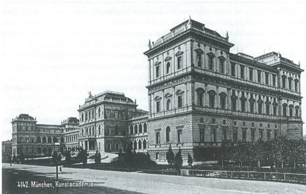
Fig. 1. Royal Academy of Fine Arts in Munich ca. 1890s, photography, source: Fuhrmeister, Christian, Hubertus Kohle, Veerle Thielemans (ed.). American Artists in Munich – Artistic Migration and Cultural Exchange Processes , Berlin, München: Deutscher Kunstverlag, 2007, 36.

strategy, employment of various subject matters, and stylistic eclecticism, which further triggered the international interest in the Bavarian capital's cultural and artistic events.